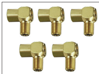
KIT-AA-VLV Fontaine kit contains 5 exhaust valves.